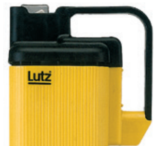
Illustration shows: pump tube SS with motor MA II